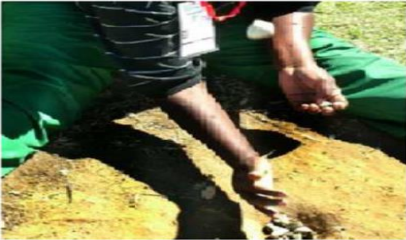
Picture 1: One Team member plays diketo

(We see the round hole, ten small round stones and one big round stone (ghoen). In round one, you throw the gohen into the air. At the same time, you scoop or lift all the stones in the hole; throw it into the air and place the nine round small stones. One follows this pattern until you complete round one and move on to round two, continuing till you reach round ten.)